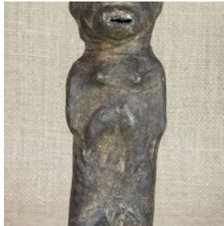
A Zigula "mummy" fetish statue.