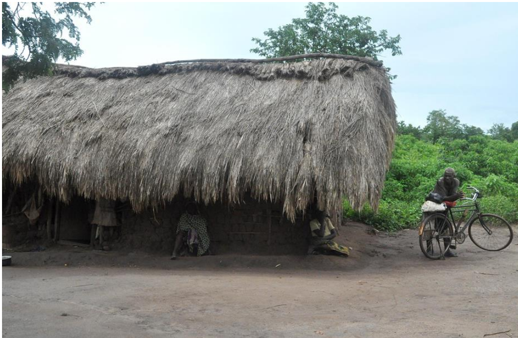
A Zigula thatched hut and family

The Zigula live in small houses which are mud walled with grass thatch. These are quite small buildings, ranging in size from about 6 square meters to perhaps 33 square meters and are grouped in small clusters of two to eight houses. At home there are chores done especially by the girls, such as carrying out domestic chores, herding goats, and fetching water, followed by a family meal which brings the day to a close.