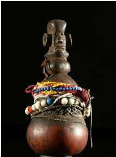
A medicinal or magical gourd decorated with fibre, stone and glass beads.

There are masks and divining objects linked to the rituals also. For example the medicine horn container is made from the animal horn, the Kudu. Medicinal or magical gourds are decorated with fibre, stone and glass beads and are used in various rituals.