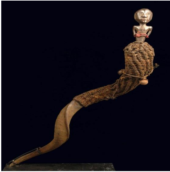
A medicine horn container