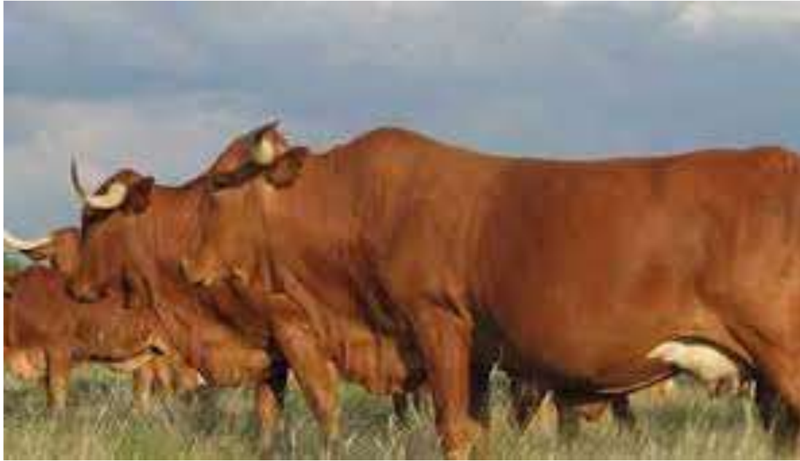
Tugen heard of cattle