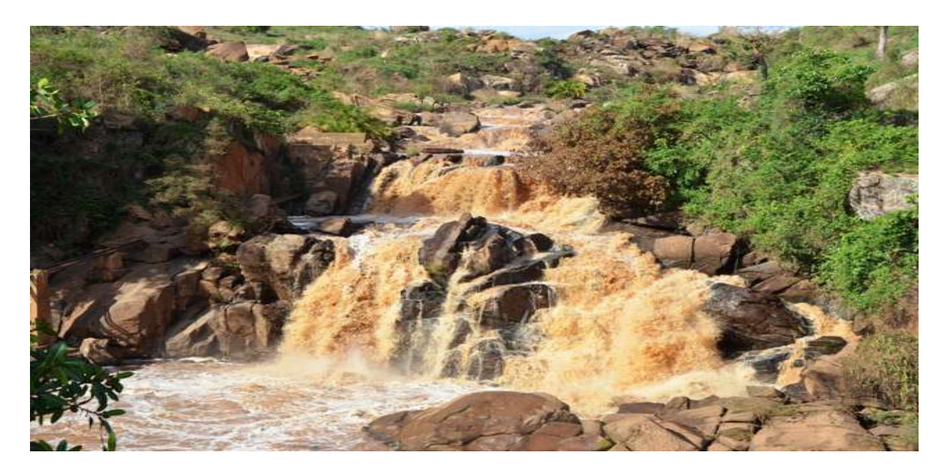
Nabuyole Falls along River Nzoia

Others are Mt. Elgon National Park, Mt. Elgon Forest Reserve, Chepkitale Forest, Nabuyole and Malakisi Falls, Sang'alo, Musikoma and Kabuchai Hills, caves at Kitum, Machingeny, Ngwarishwa, Chepnyali and Kiptoro. All these bring good income to the country.