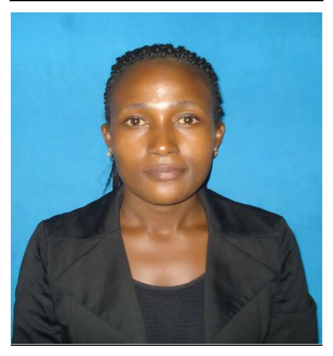
By ANNASTASI OISEBE African Proverbs Working Group NAIROBI, KENYA AUGUST, 2017.