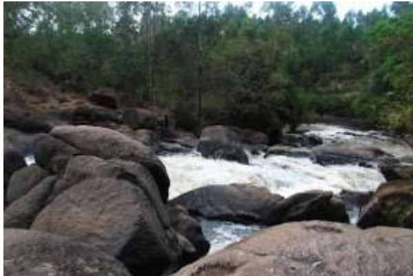
The Tindinyo Falls on River Yala

Good income is received from tourism and conservation. The attraction sites in Nandi South are the Nandi Rock and the South Nandi Forest . In Nandi North, there is the Chepkiit Water Falls on the Kipkaren River. In Nandi East, there is the famous Koitalel Samoei Museum in Nandi Hills town and the Keben caves in Mogobich, Lessos Division and the Nandi escarpment.