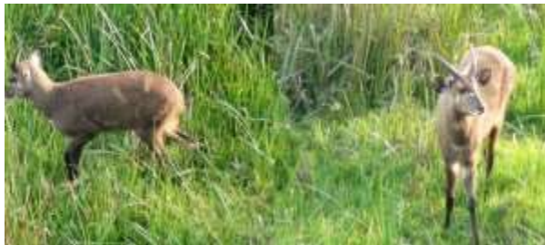
The Sitatunga gazelle

The main wildlife in the county is the Sitatunga gazelles at Kingwal Swamp, Columbus monkeys found in the South Nandi Forest. There is also a wide variety of different bird species and snakes across the county. There is also the Tindinyo Falls along River Yala.