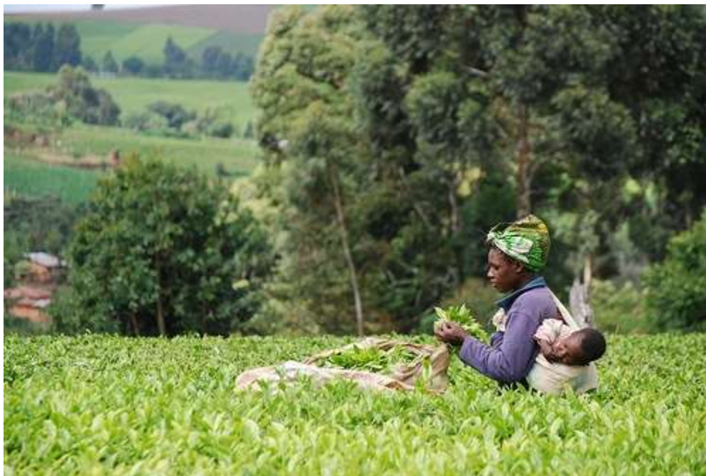
A woman harvesting tea in the Nandi Hills region

Their economy relies mainly on surrounding tea estates. Many people work on tea farms as pluckers, managers, field maintenance, factory service works, official duties and business. Farmers on the Uasin Gishu plateau also grow maize, wheat and pyrethrum. Other subsistence crops include beans, pumpkins, cabbages, other vegetables, sweet and European potatoes, and small amounts of sorghum. Sheep, goat and chicken are kept. Iron hoes were traditionally used to till, but today, ploughs pulled by oxen or rented tractors are used to till the land.