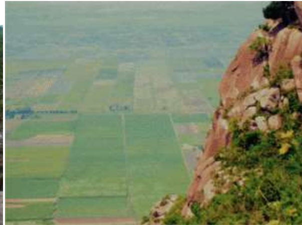
The Nandi escarpment

The main wildlife in the county is the Sitatunga gazelles at Kingwal Swamp, Columbus monkeys found in the South Nandi Forest. There is also a wide variety of different bird species and snakes across the county. There is also the Tindinyo Falls along River Yala.