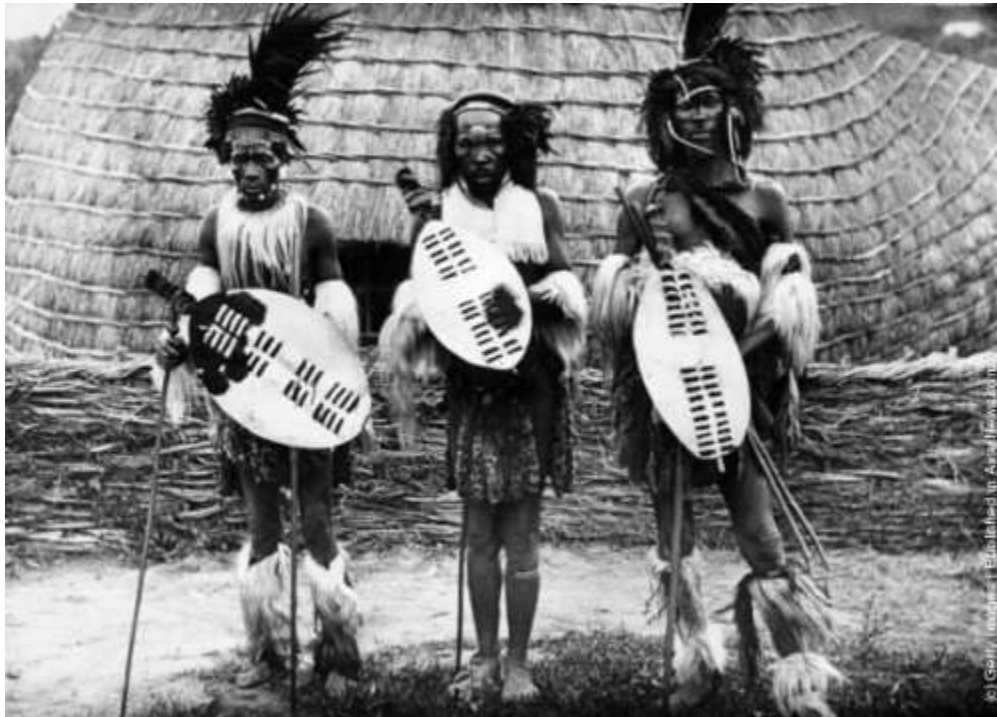
Picture of Nandi in traditional clothing

Traditional Nandi clothing consisted of skins of either domesticated or wild animals. Earrings were common for both sexes in the past, including heavy brass coils that made the earlobe stretch down almost to the shoulder. Today, the Western-style dress of most Nandi, even in rural areas, is hardly different from that of people in nearby towns. Men wear trousers and shirts, usually with a suit jacket or sport coat. Women wear skirts and blouses, dresses, and/or Kangas —locally made commercial textiles that are used as wraps (one for the top and one for the bottom). Young people of both sexes like T-shirts with logos, especially those of American sports teams or ones bearing the likeness of famous entertainers.