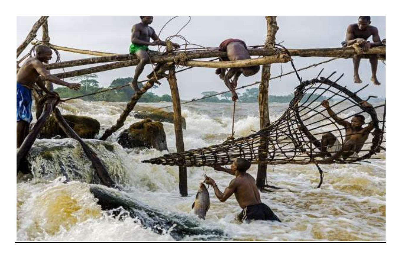
The Lokele people fishing in the river

Stanley returned in 1883 to Kele country and found the tribe scattered by Arab traders. The Lokele, were traders and fishermen in the pre-colonial times, travelling long distances up and down the Congo-River, exchanging fish for the products of the forest people and establishing small colonies.