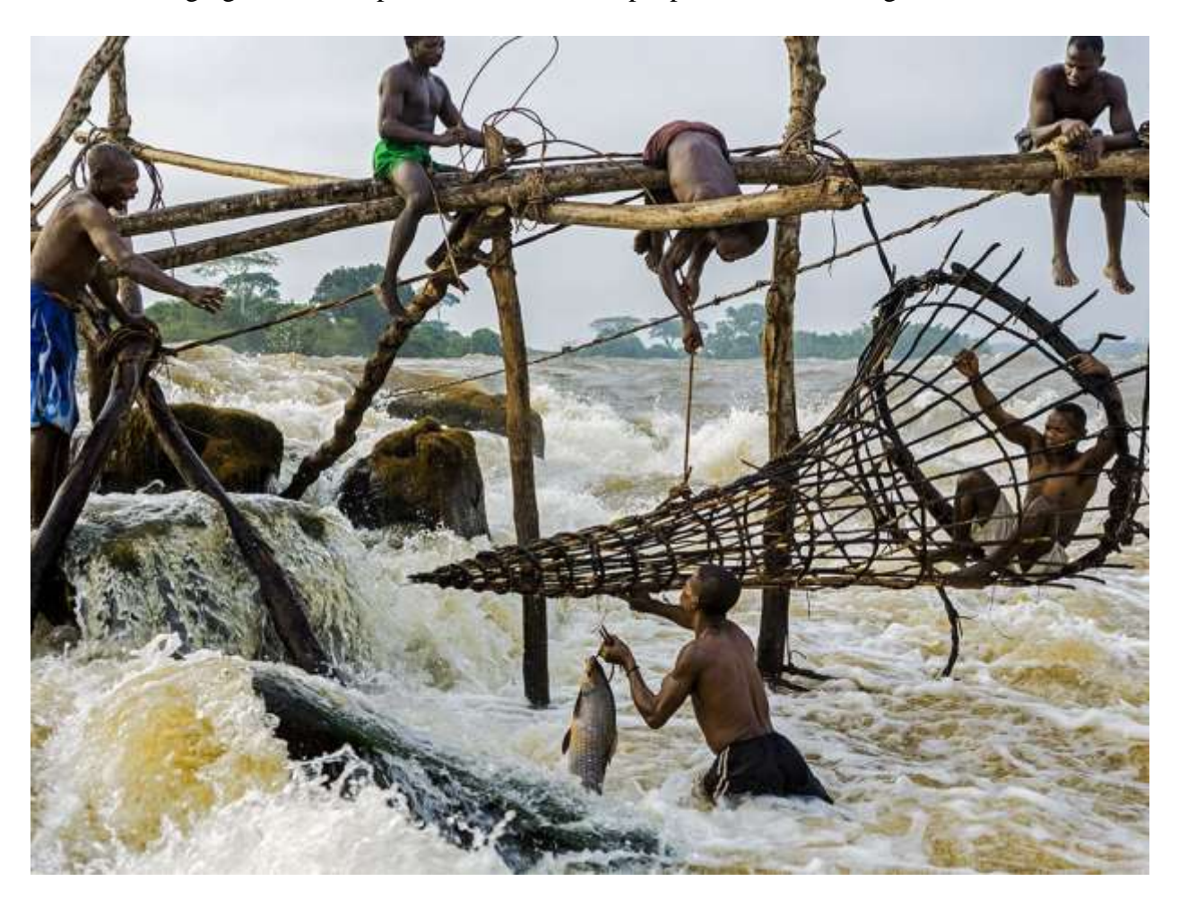
The Lokele people fishing in the river

Stanley returned in 1883 to Kele country and found the tribe scattered by Arab traders. The Lokele, were traders and fishermen in the pre-colonial times, travelling long distances up and down the Congo-River, exchanging fish for the products of the forest people and establishing small colonies.