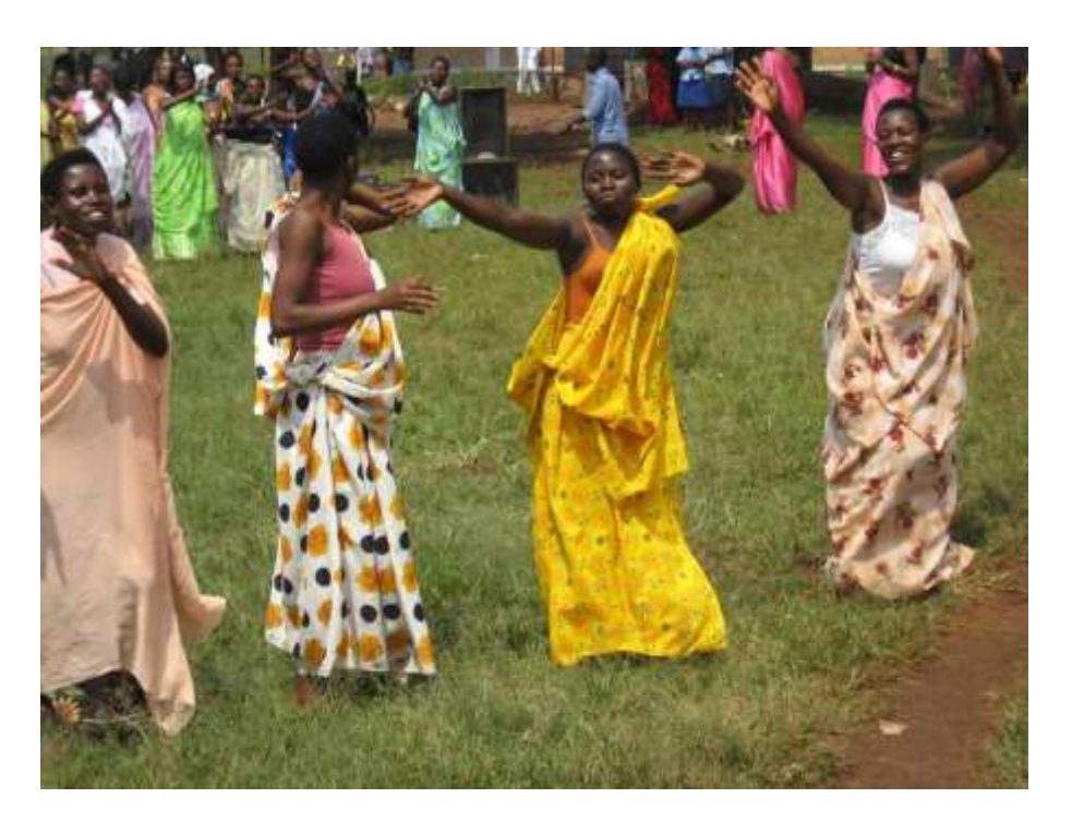
The official shanana dress

According to their marriage customs, a man has to provide a dowry that consists in cows. When giving the dowry on this traditional wedding day, the whole community wears a special traditional outfit called Mushanana. The ceremony is entertained by the umidiho dance and poems with Abasaza (old men) always in proverbs and saying, inviting the young bride and groom to live in harmony and invite young people to not forget this tradition. Many homesteads are headed by widows following the conflicts in the regions.