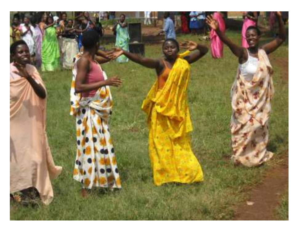
The official shanana dress

traditional outfit called Mushanana. The ceremony is entertained by the umidiho dance and poems with Abasaza (old men) always in proverbs and saying, inviting the young bride and groom to live in harmony and invite young people to not forget this tradition. Many homesteads are headed by widows following the conflicts in the regions.