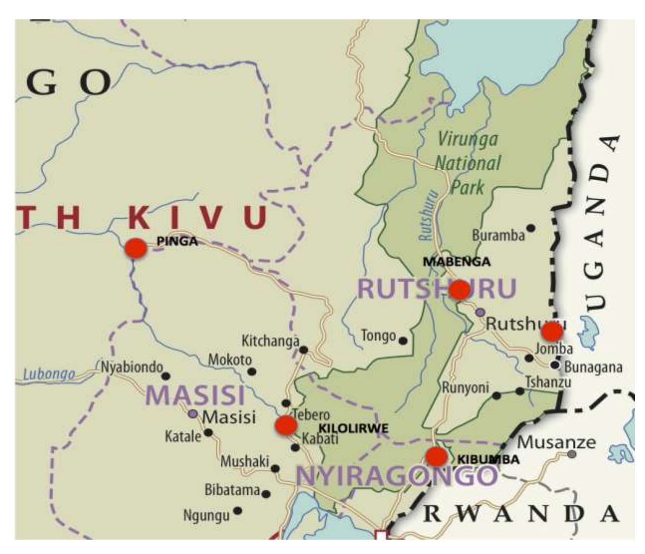
The Ethnographic Location Of The Banyabwisha In D R Congo