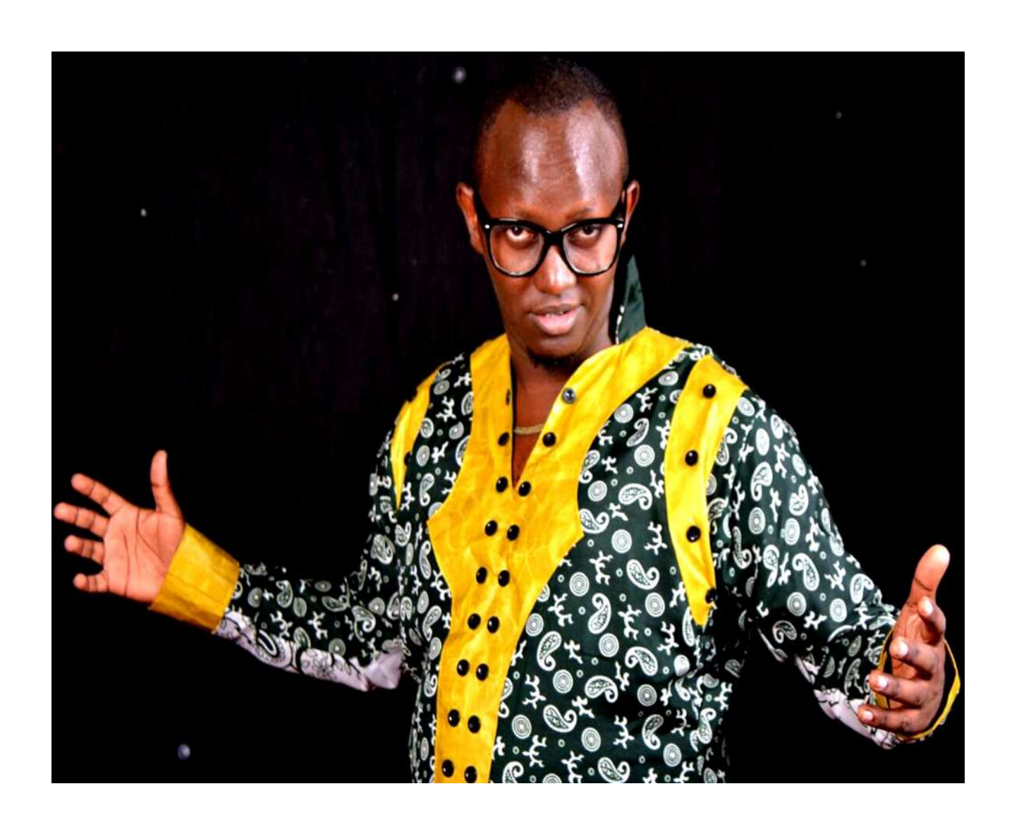
BY BENON BENJAMIN CHELO Nairobi, Kenya MAY 2017