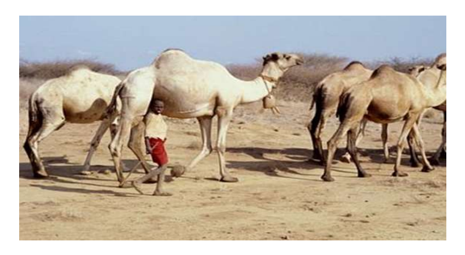
A Rendille boy herding camel

They cling to a nomadic life of herding camels, goats and cattle. The meager vegetation will only support camels, goats and sheep thus the Rendille are majorly nomadic people. Each mobile clan-based village moves on an average four times a year. The livestock live in highly mobile satellite animal camps known as foor in areas where the grazing is better. They are regularly moved as soon as an area gets depleted, giving it a chance to recover. In this way the Rendille people are able to survive, but only with an average life expectancy of 40 years. Over the years, the Rendille have been harassed constantly by the more powerful groups of Oromo and Turkana, adding to the harshness of their existence. Some sources also report problems with the Somali, but the Somali have had a relatively benevolent view of the Rendille as distant relatives.