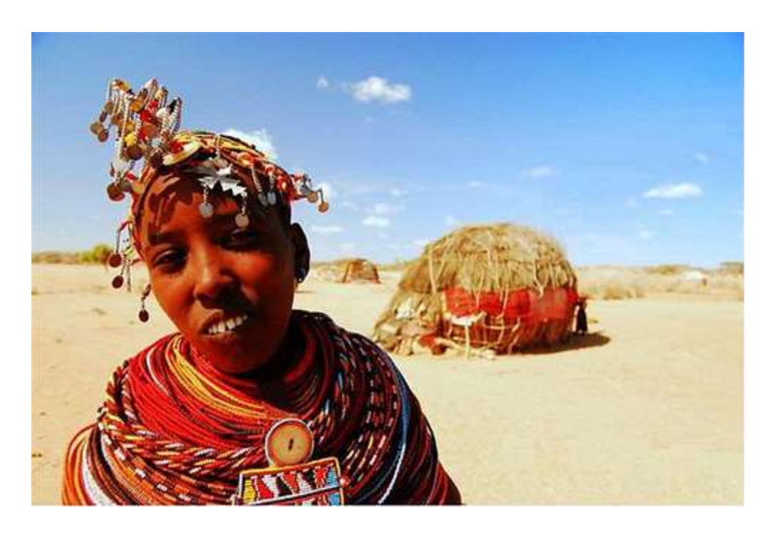
Traditional Rendille woman near a hut

There are about eight or nine sub clans including the Urowen, Dispahai, Rongumo, Lukumai (Nahgan), Tupsha, Garteilan, Matarbah, Otola, and Saale. The houses are made of a stick framework with mats made from wild sisal fastened to them. Two cow skins form the doorway. The whole hut is designed to be taken down and strapped onto a camel. The huts are built in a circle. The thorn enclosures for the livestock are inside the circle, so that any marauders would have to pass the huts to get to the animals. Right in the centre is the naabo or gathering place where they meet to pray and to discuss village matters. The Rendille proverbs were used to tell stories and uphold family values when advising members of their community.