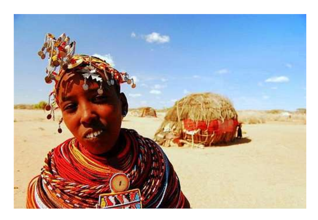
Traditional Rendille women near a hut

There are about eight or nine sub clans including the Urowen, Dispahai, Rongumo, Lukumai (Nahgan), Tupsha, Garteilan, Matarbah, Otola, and Saale. The houses are made of a stick framework with mats made from wild sisal fastened to them. Two cow skins form the doorway. The whole hut is designed to be taken down and strapped onto a camel. The huts are built in a circle. The thorn enclosures for the livestock are inside the circle, so that any marauders would have to pass the huts to get to the animals. Right in the centre is the naabo or gathering place where they meet to pray and to discuss village matters. The Rendille proverbs were used to tell stories and uphold family values when advising members of their community.